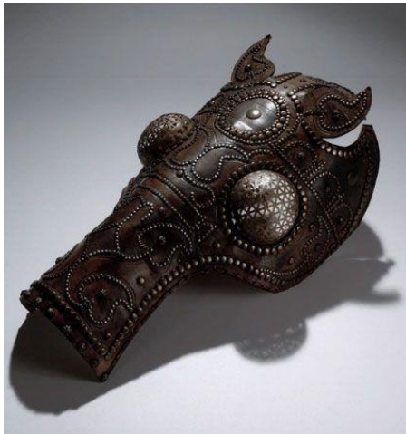
Replica horse chamfron

In this activity you can try and make your own Roman army 'marching' sandals. Feel free to use any materials available to you. Included here are some links for your own research to help if you'd like to investigate the subject a little more - alternatively just follow our instructions.