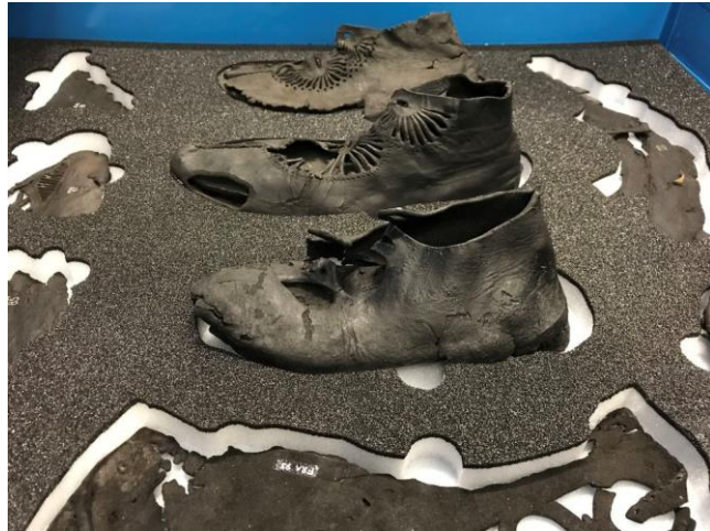
1,800-year-old shoes from Trimontium